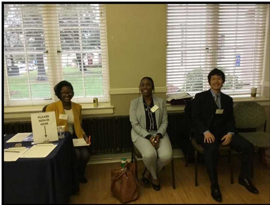
Commission staff providing support at Legislative Coffee Chat

In January 2018 and March 2018, respectively, the Commission hired an Operations Manager and a Marketing & Outreach Analyst. Hiring both staff members filled critical roles within the Commission's operations that were previously held by retired annuitants. With the hiring of these 2.0 positions, the Commission was fully staffed at the 5.0 level and reduced the number of temporary staff supporting the Commission. In April 2018, the Commission moved to a facility with other California Government Operations Agency departments. This move, facilitated by DGS' Real Estate Services Division, supported the Commission's growing operations to provide adequate space for its 5.0 authorized positions and onsite facilities for the Commission's public meetings. The Commission also partnered with the Department of Rehabilitation's Workability Program to bring volunteer support for data collection efforts.