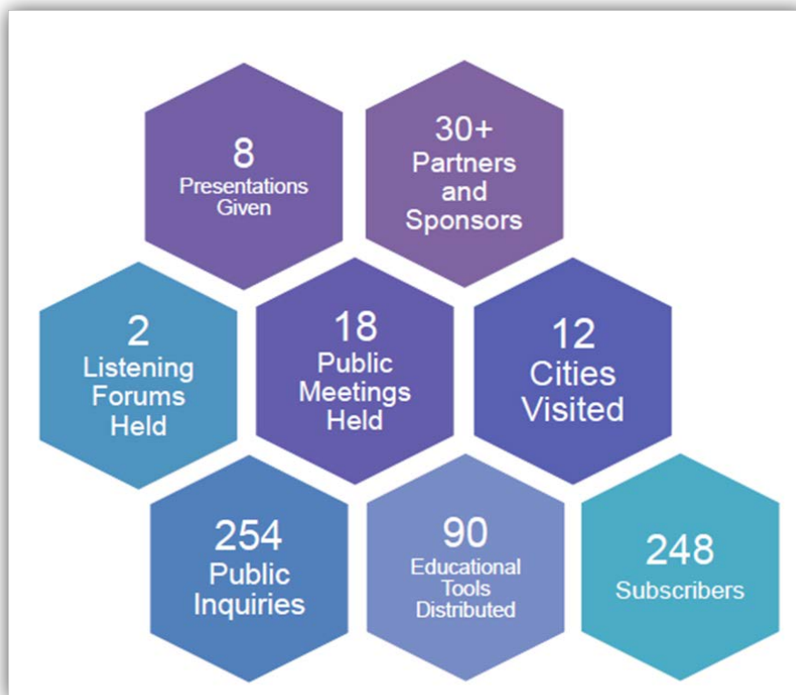
Figure 1: 2018 Commission Statewide Impact (in addition to our website presence)

Commission staff also implemented an internal tracking system to log the type (i.e., phone or email), number, and category of public inquiries received. Based on the information collected, the top three incoming public inquiry category types were: 1) building code requirements, 2) disability access law questions [non-construction related] and 3) discrimination based on disability.