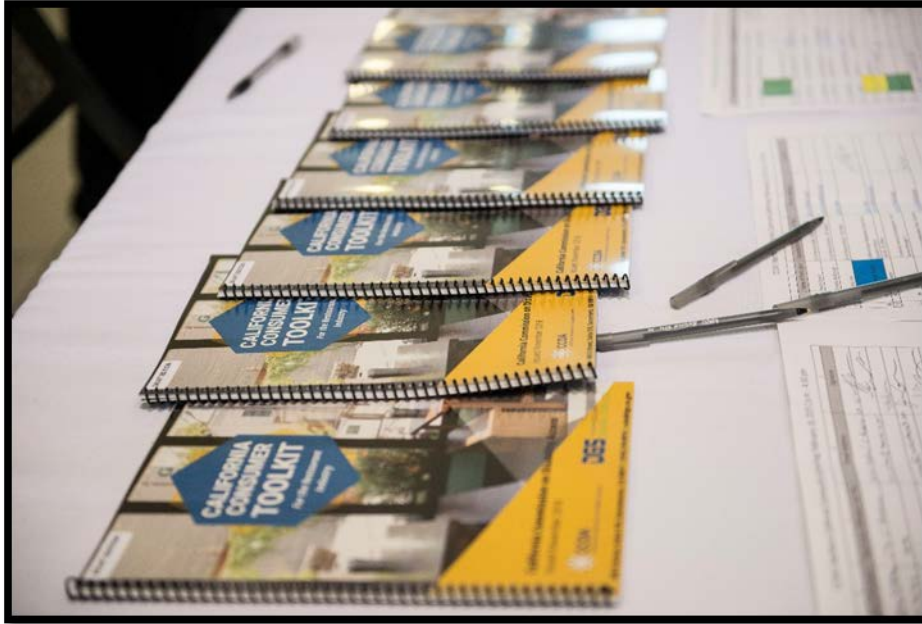
Commission restaurant industry toolkits