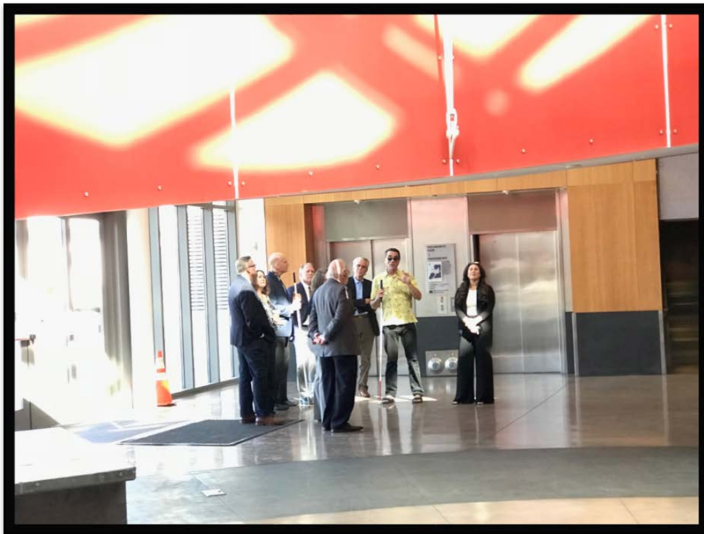
Commissioners learning about universal design features of Ed Roberts Campus in Berkeley