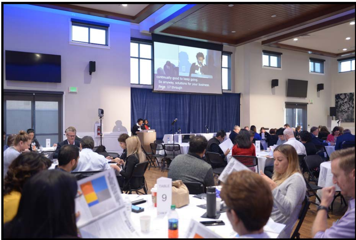
Participants at Central Valley Community Gathering reviewing toolkit at roundtables